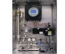
TDL600 Process Moisture Analyzer