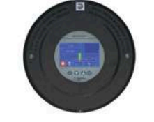
QMA601 Process Moisture Analyzer