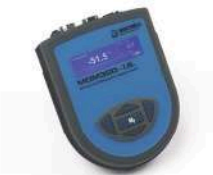
MDM300 I.S. Portable Dew-Point Hygrometer