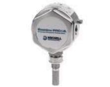
Easidew PRO I.S. I.S. Dew-Point Transmitter