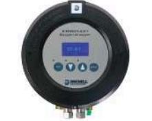
XTP601 Oxygen Analyzer

Michell Instruments adopts a continuous development programme which sometimes necessitates specification changes without notice. Issue no: Easidew PRO XP_97459_V6.8_EN_0325