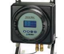
Promet EExd Process Moisture Analyzer