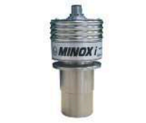
Minox i Intrinsically Safe Oxygen Transmitter